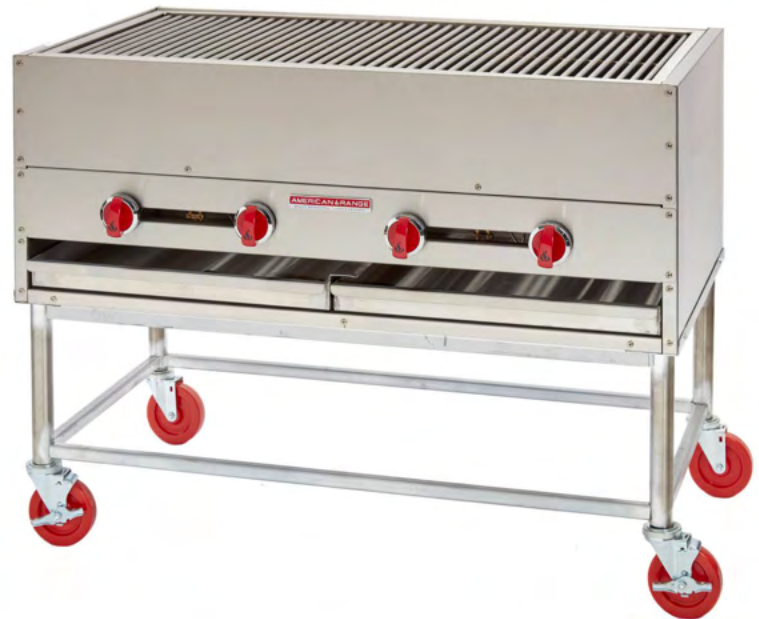
Model Shown AHS-4836 Shown with optional casters