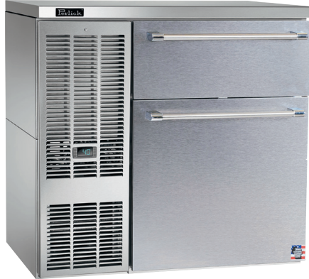
BBS36 with optional liquor drawers shown