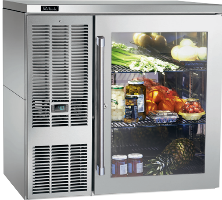
BBS36 with optional glass w/stainless steel door shown