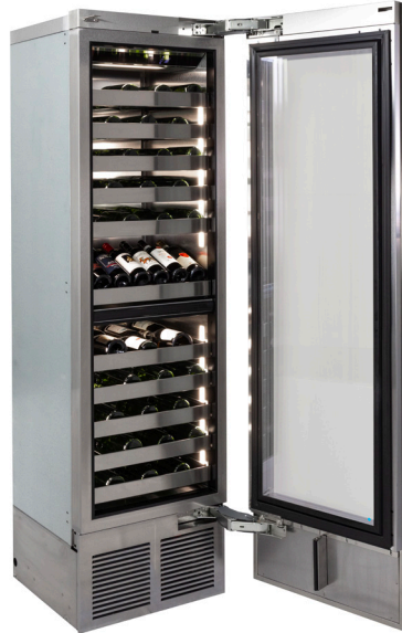
Shown with convertible shelf in display mode