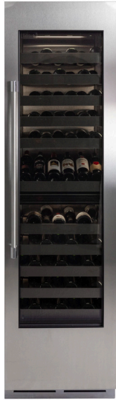
Shown with optional stainless steel door overlay panel