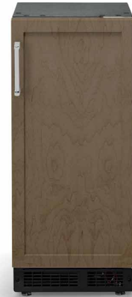
FNIU515D (shown with custom panel)