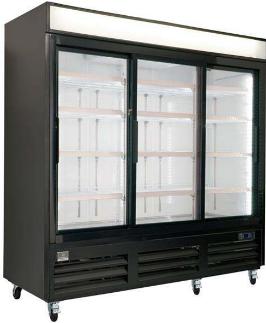
738320 (KCHSGM72R) 3-Sliding Glass Door Full Height Merchandiser Refrigerator 83" Long