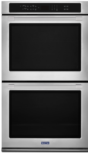
Fingerprint Resistant Stainless Steel MEW9630FZ