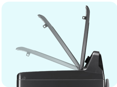
Soft-Close Glass Lid