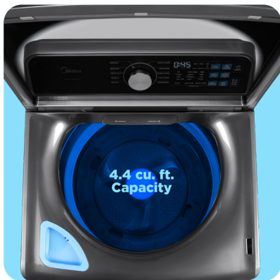
4.4 cu. ft. Capacity

Our 4.4 cu. ft. Top Load Washer delivers exceptional cleaning performance and capacity in a modern design, combining a metallic grey finish, a soft-close glass lid, and contoured edges for a clean, modern look.