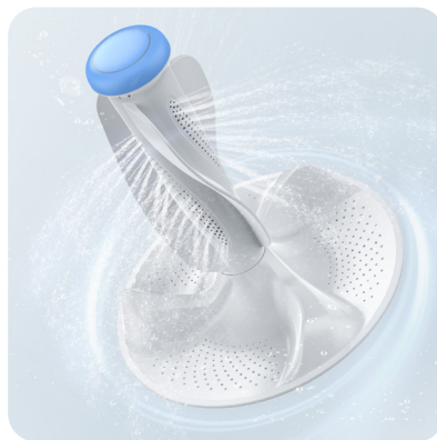
Power Wave 360° Agitator™