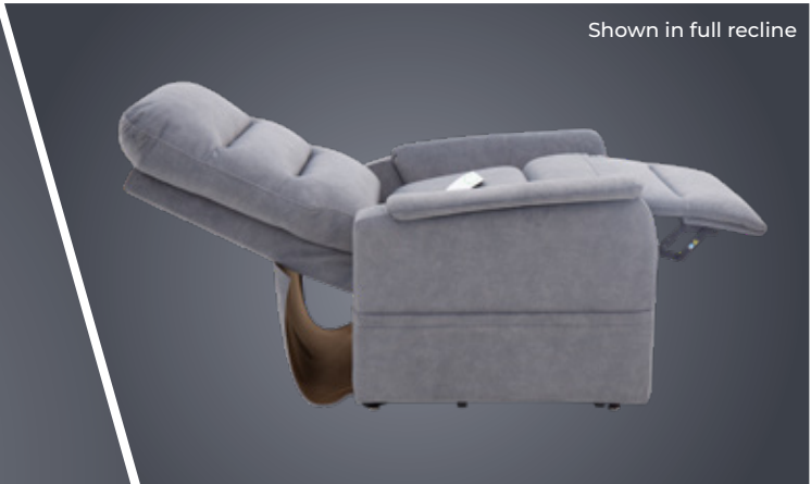
Shown in full recline