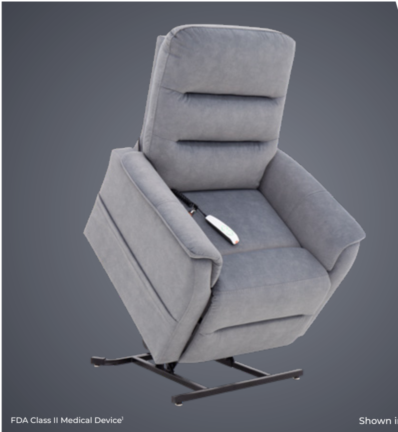
FDA Class II Medical Device 1