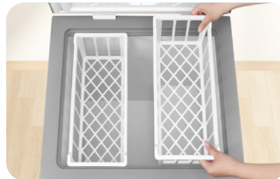
Removable Storage Baskets