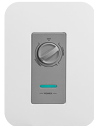
Exterior Control Panel