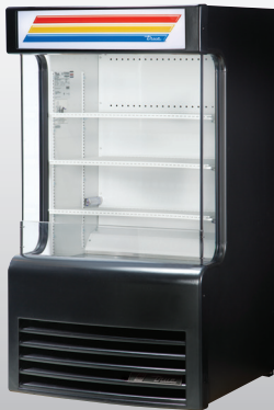
Shown with flat shelving.