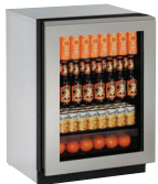
INTEGRATED FRAME (STAINLESS HANDLELESS PANEL)*