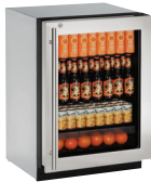
STAINLESS FRAME (LOCK)