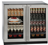
STAINLESS FRAME (LOCK)