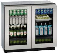
INTEGRATED FRAME (STAINLESS HANDLELESS PANEL)*