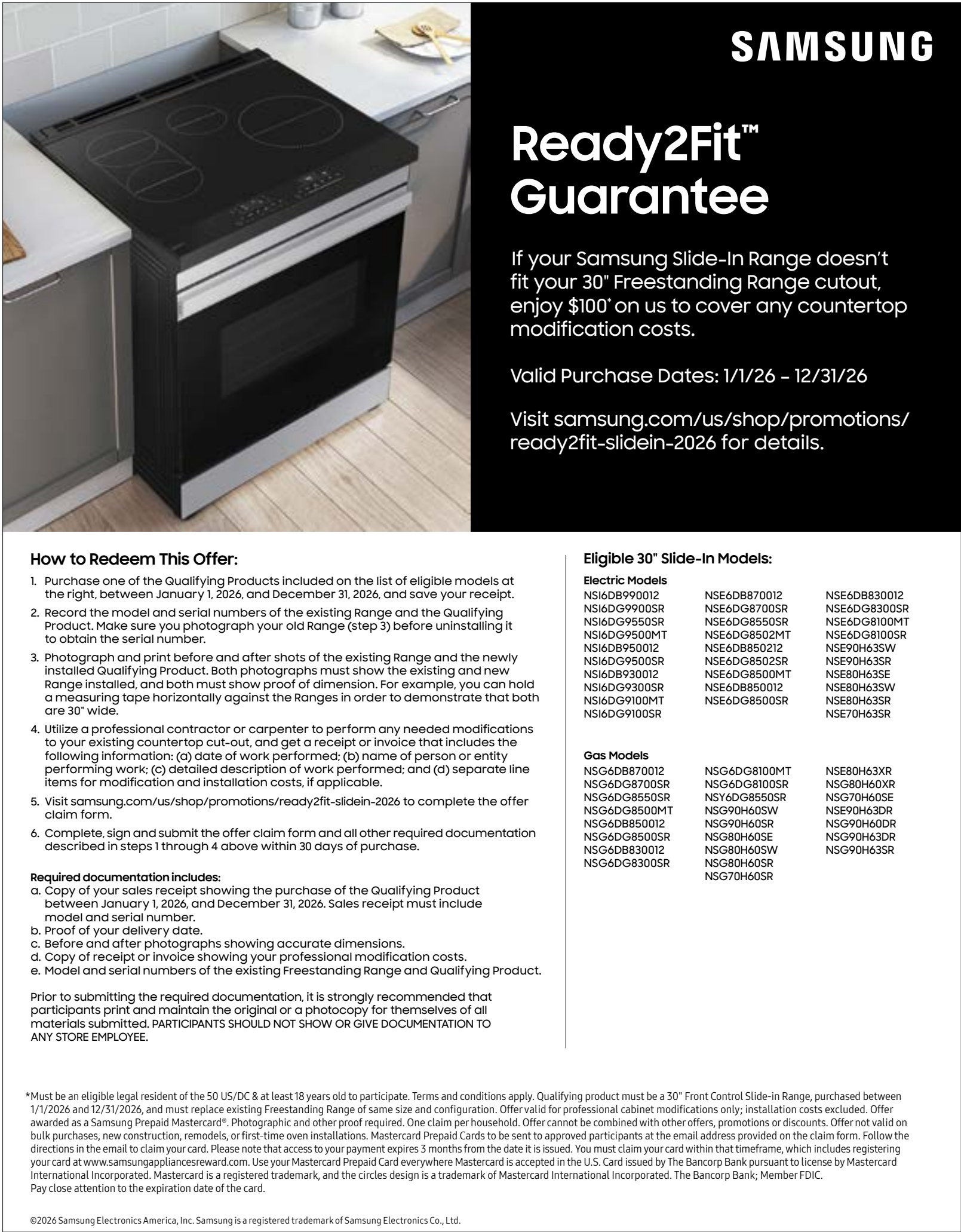
MIR One Sheet

See Samsung EasyAds link to download this one sheet asset.